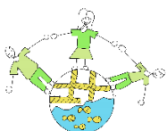
Bridport Primary School