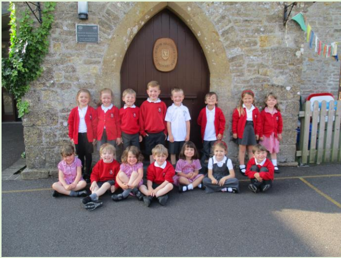
📖 Our new Wagtails have settled in really well! 🏡

Our School Values are Hope, Respect, Friendship, Love, Courage and Happiness . We are paying particular focus to Hope this half term. Along with our weekly Good Work Assembly, there will be a half termly values assembly where the children nominate a classmate who they feel has met the value consistently.