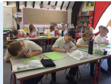
📖 Owl class have been working on their class charter this week. 📄