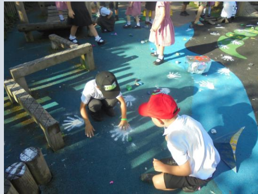
👁️ A curious discovery was made by Robins class. Did an alien spaceship crash-land onto our playground? 🛸