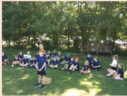
☀️ Kingfishers have been making the most of the lovely September sunshine. ☀️