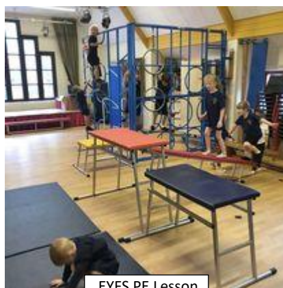
EYFS PE Lesson