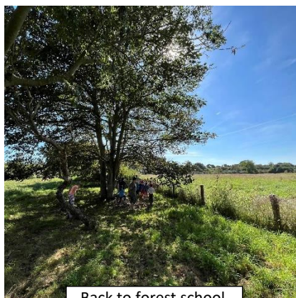
Back to forest school