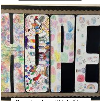
Our values board this half term