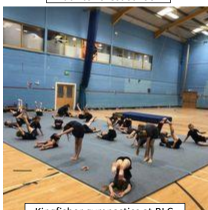
Kingfisher gymnastics at BLC