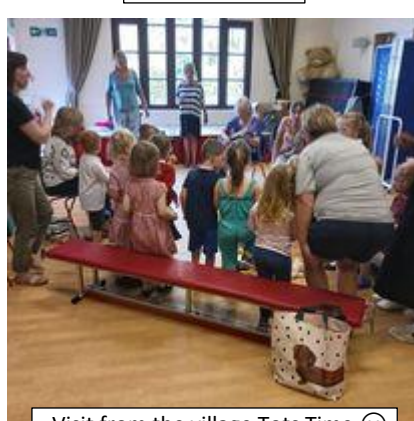
Visit from the village Tots Time 😊