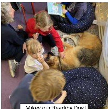
Mikey our Reading Dog!