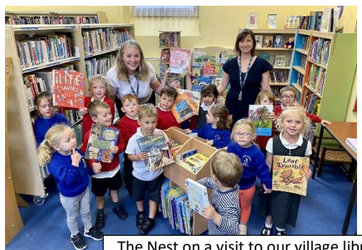
The Nest on a visit to our village library.