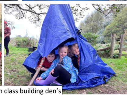
Robin class building den's at Forrest School.