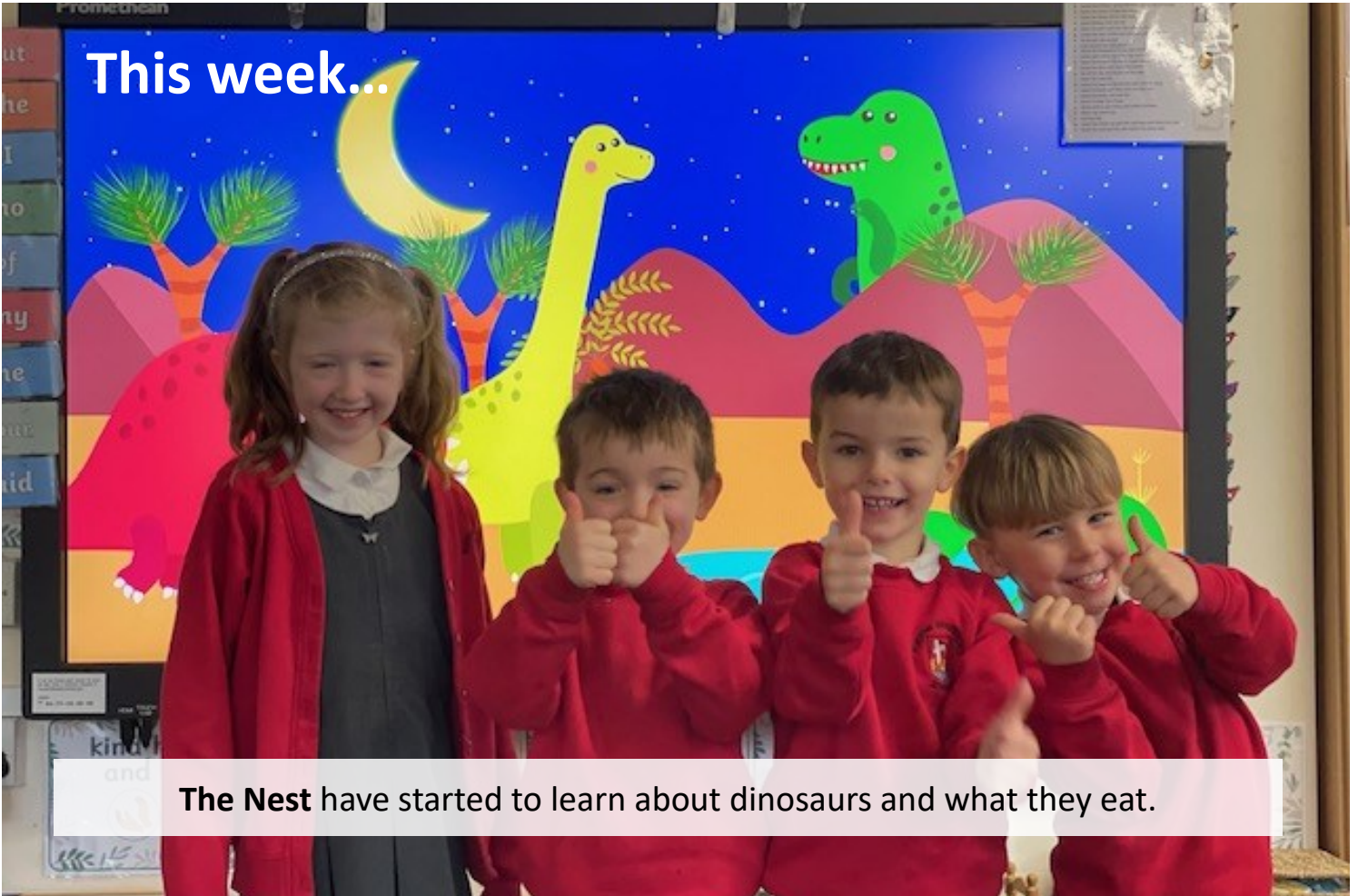
The Nest have started to learn about dinosaurs and what they eat.