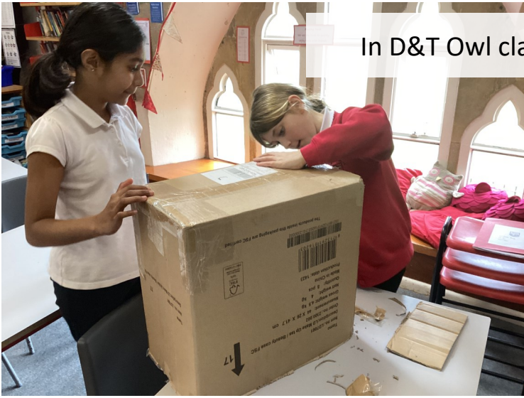
In D&T Owl class made igloos!