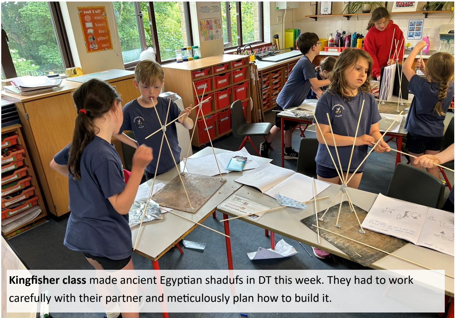
Kingfisher class made ancient Egyptian shadufs in DT this week. They had to work carefully with their partner and meticulously plan how to build it.