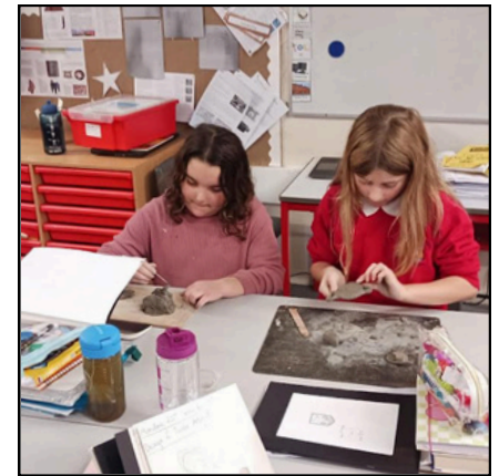
Owls had fun making their Taotie designs with the clay this week!