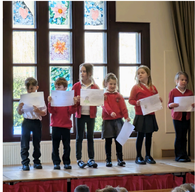
Robins have been learning about special people in school