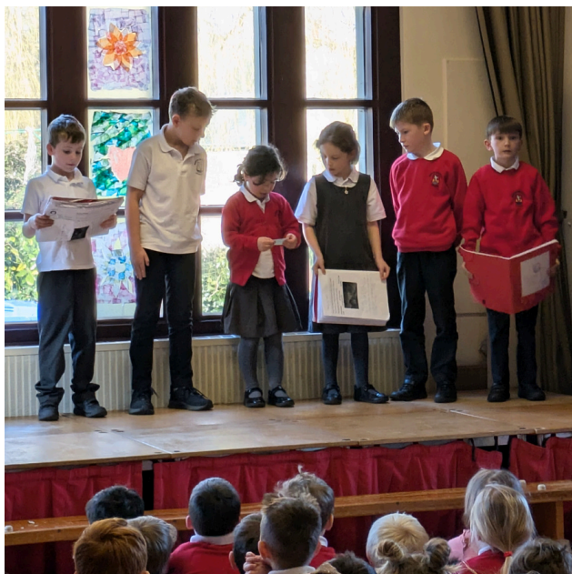
Kingfishers have a new topic and were very excited to share.