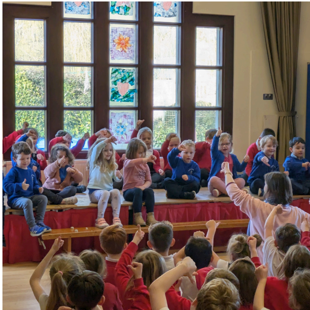
The Nest performed their Talk for Writing story, Mr Wiggle and Mr Waggle.