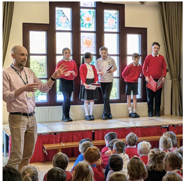
Owls made smoothies in DT. See p.9 for pics!