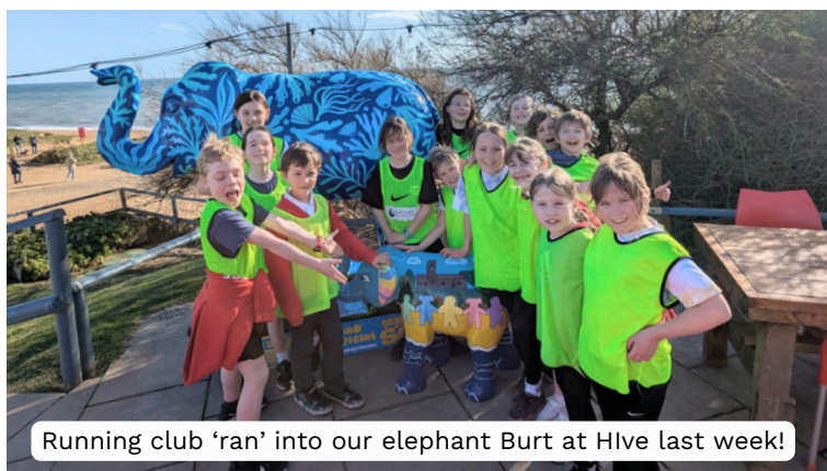
Running club 'ran' into our elephant Burt at Hlve last week!

Visit the PTA page for a full list of jobs, what is involved and the time commitment and choose the one that best suits you and your family - it couldn't be easier! LINK HERE