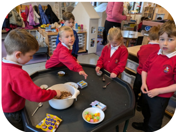
Children in The Nest having fun making Easter Nests!