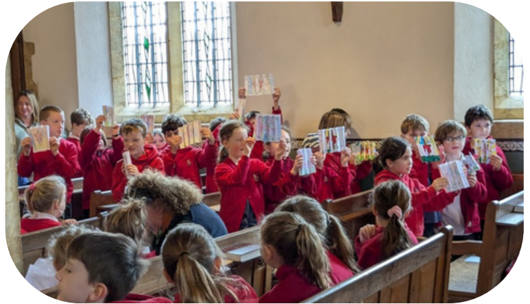
Our whole school Easter Service